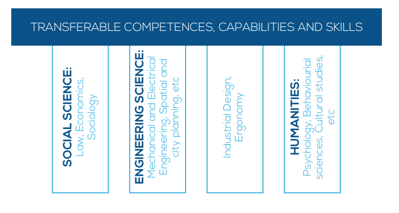
EXAMPLE: A POSSIBLE INTERDISCIPLINARY TEAM OF MEMBERS WITH T-PROFILES E.G. IN THE AREA OF AUTOMOTIVE ENGINEERING

The aim is that the doctoral researcher achieves this T-shaped qualification profile. The vertical bar represents the specialization and expertise in a certain discipline or domain. The horizontal bar represents the openness, interest and curiosity towards other disciplines and domains as well as the competences, capability and skills to work as a professional in different environments. With interdisciplinary teams becoming an increasingly strong characteristic of the engineering sciences, TU's have responded to the need for the accompanying new set of competences, capabilities and skills through their doctoral training